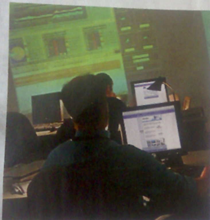
State-of-the-art Networks Operations Centre at Fasthosts